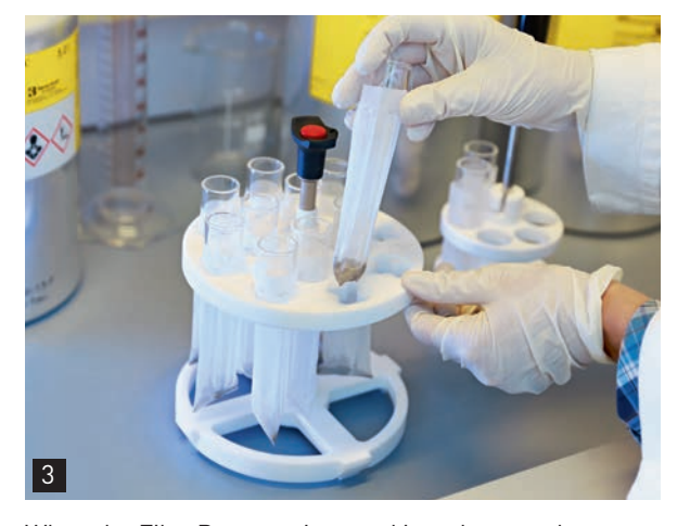
When the FibreBags are inserted into the sample carousel, they are automatically clamped firmly in place.