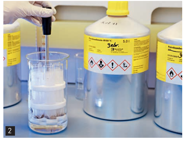
Convenient, time-saving degreasing with solvents in the degreasing module. 6 samples can be treated at the same time.