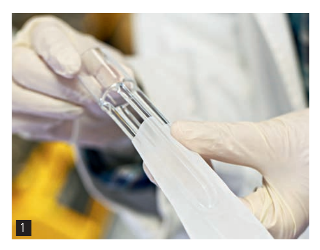
Easy handling: Insert FibreBag, weigh sample and you're ready. No need to seal the filter bag.