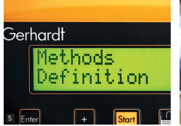
9 different methods can be freely configured and saved.