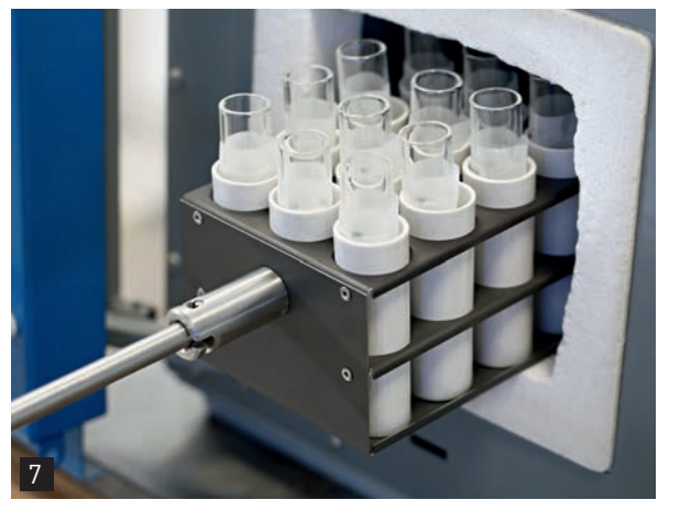
The incinerating module with a long handle makes handling of samples easier.