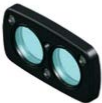
Diffuser lens for clear liquids