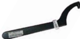
Spanner Wrench (necessary for tightening Tank Adapter)