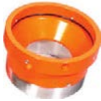
Tank Adapter (Air Purge Ready)

The OptioLaser S300 has a selection of options for use in tanks / silos.