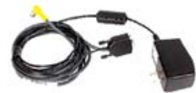
S200 12VDC Power Communication Cable